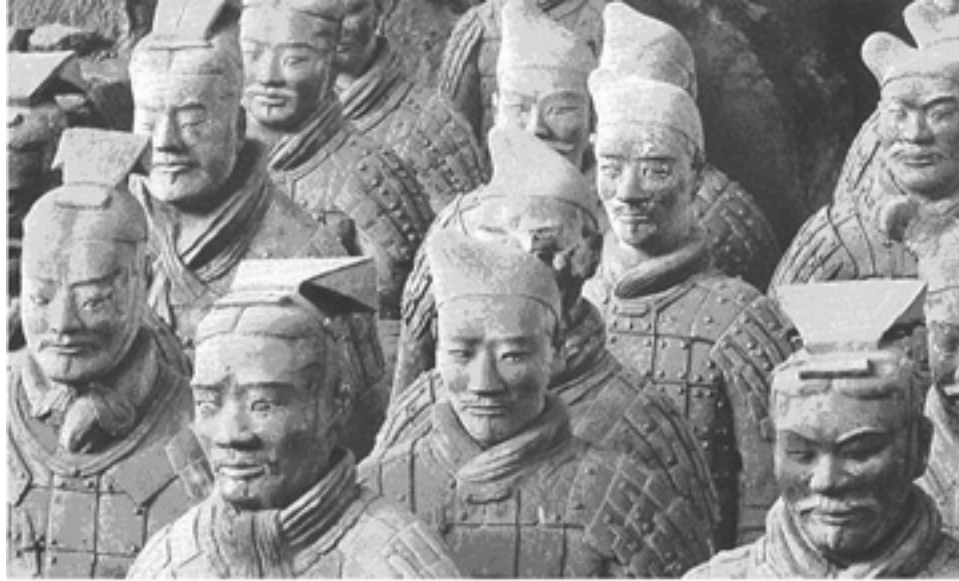
Figure 2. Qin Terra-Cotta Figures of Warriors and Horses