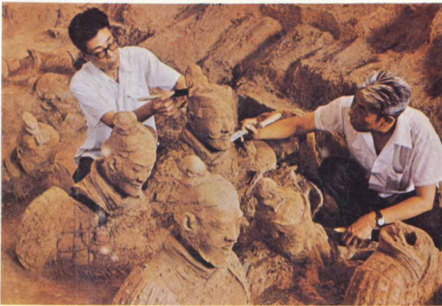
Chinese archaeologists work on excavating terracotta warrior figures from the tomb.

Emperor-I's crew had prepared well for a variety of location hardships, but the shoot still presented surprises. Among other obstacles, they had to contend with severe environmental conditions, distance from service centers for Betacam support, and an often unsteady power supply that meant lots of battery shooting and uncertainty about recharging. According to Gant, McKay braved