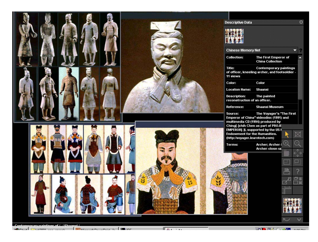
Figure 5: High-resolution images of the standing warriors retrieved from The First Emperor of China Collection (Visual Exhibition) for closer study in the Image Workspace

In addition to high-resolution images, relevant and related digital videos can also be retrieved over the Internet, and hyperlinks to relevant text and non-text resources can also be made. This clearly demonstrates the incredible potential for scholarly study and research. With this type of information available globally via Internet, we can truly see how "information access" has been elevated to a totally different and much higher level.