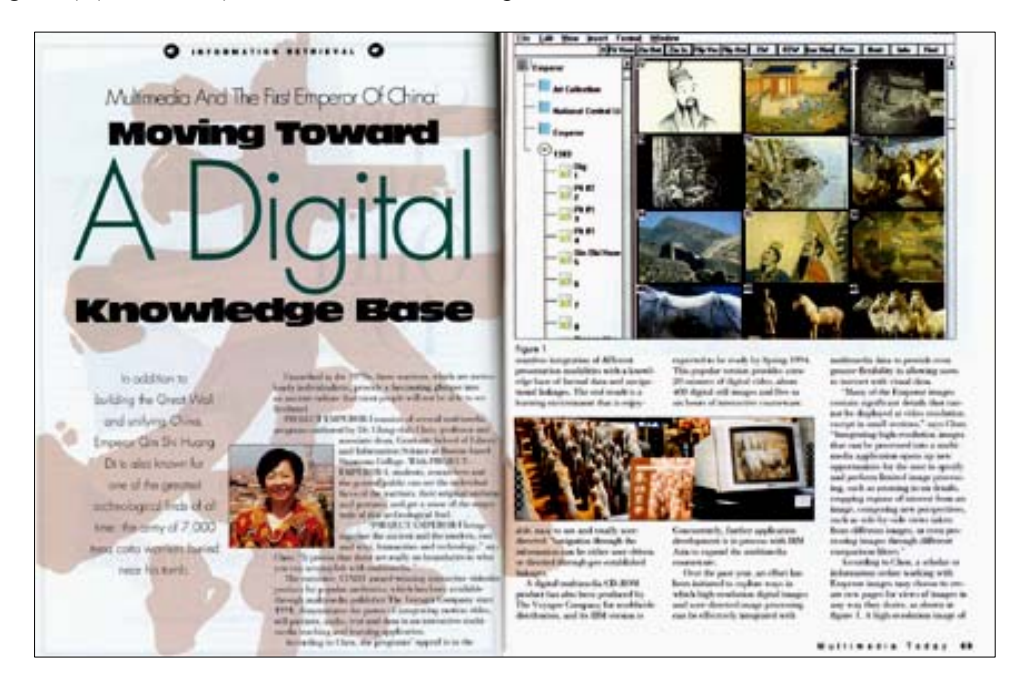
Figure 3: Images of the first two-pages of the featured article on "digital knowledge base"

With the advent of communications and information technologies in the early 1990s, and the anticipation of the coming of the Internet, it became clear to me that in order to promote better information sharing in the coming "digital" age, there is a real need to work toward a "digital knowledge base." Again, The First Emperor of China was a perfect example used to prepare several feature articles including that in the 1994 issue of IBM's Multimedia Today (Figure 3) (Chen, 1994) to advocate such a concept.