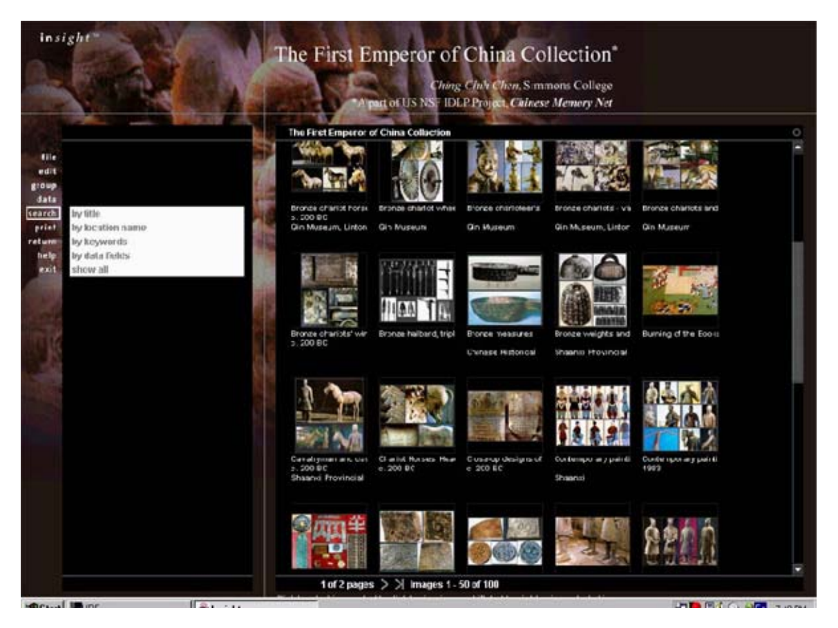
Figure 4: The Group Window of The First Emperor of China Collection (Visual Exhibition)

While time and space preclude more detailed discussion (see Chen, 2001 for more information), the following figures will show some of the features of the latest CMNet's The First Emperor of China Collection's prototype image system consisting of 250 images of very high resolution, ranging from 10 to 75 MB each in its compressed TIFF format. This visual collection utilizes Insight<sup>®</sup> of Luna Imaging, Inc. This Exhibition enables distributable and scalable online access to images from anywhere. It provides a dynamic and interactive user environment where one can view, compare and organize images, or even present them to others. Figure 4 is the Group Window of The First Emperor of China Collection. All functions for finding, displaying and using images begin from this window.